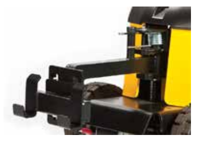
Return To Straight Arm