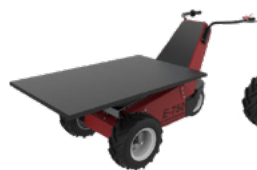
Flatbed - 2 sizes Short: 31" W x 38" L Long: 31" W x 48" L