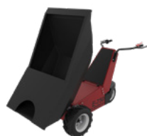
Concrete Funnel Cap